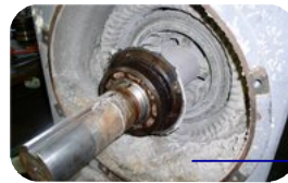
BEFORE Compacted pulp

Air passages, vents, screens and louvers must be kept clean so that the motor can distribute the heat that develops. Cooling fans must be kept free of debris inside and outside. Discuss Class II Overhaul with your GPR Rep.